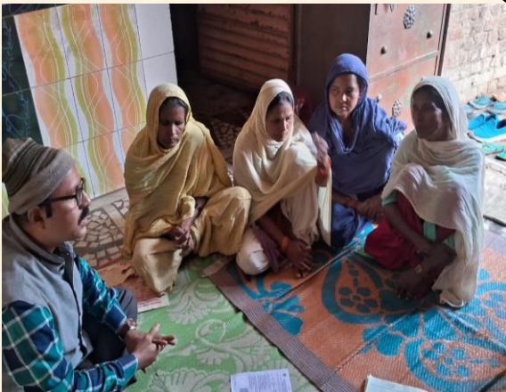
Group Level Leadership Training around the Quarter