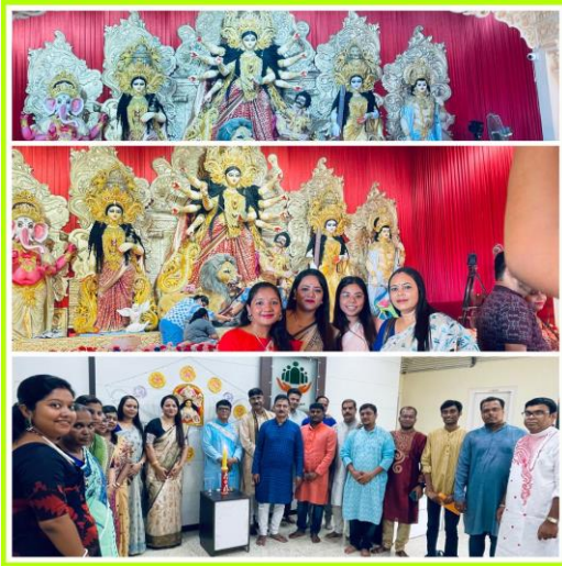
Embracing Tradition at Work : Durga Puja