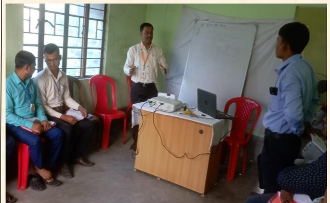
Targeted Support and Motivation for Branch Staff