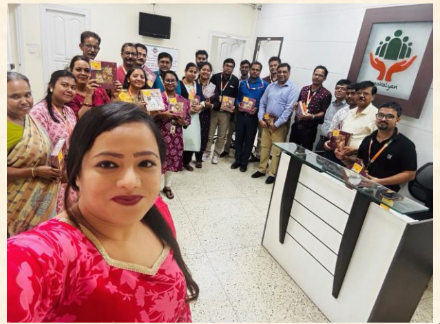
A Glimmer of Diwali Joy