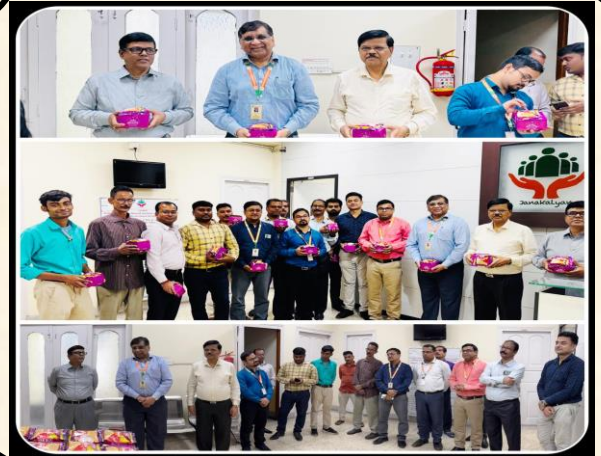
Men's Day : A Tribute to Our team